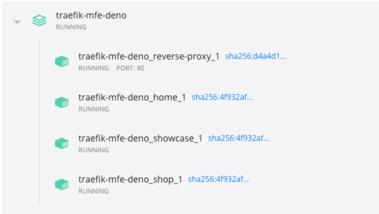
Figure 1: services running in containers in the docker dashboard

With our setup complete, we can build and run our stack with docker compose up --build .