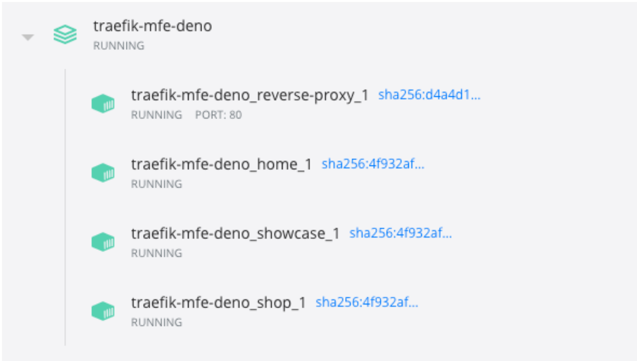
Figure 1: services running in containers in the docker dashboard

With our setup complete, we can build and run our stack with docker compose up --build .